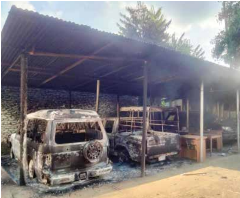
Burnt up vehicles of CHT Regional Council