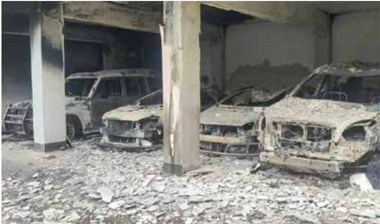
Burnt up vehicles of CHT Regional Council

Towards 11:00 pm, an army vehicle from the Cantonment was on the way to Swanirbhar area. The youth students coming from Gachban and Perachara blocked the vehicle on the road. They got involved in hot exchanges with the army. The youth students used catapult against the army. At certain stage, the army opened fire at them. At this, 20 Jumma